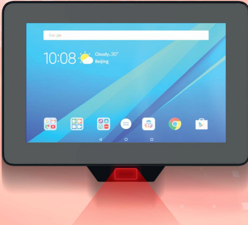
11.6" HD Display